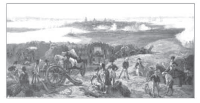
"Siege of Charleston"

reflected tremendous tension between the Patriot militias and resident Loyalists. It was assumed that