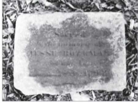
Headstone fragment for Jesse Bozeman (Photo taken October 28, 2014)

buried there too. Of course, untold others may be buried within the forestation of the cemetery. (For a 1936 inventory of the cemetery, see Appendix B-1)